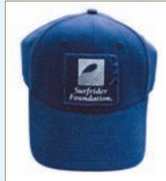
SURFRIDER BASEBALL HAT navy blue flex-fit ONE SIZE $22